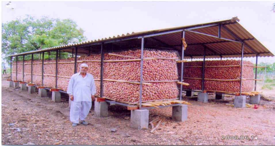
A happy farmer with scientific onion storage