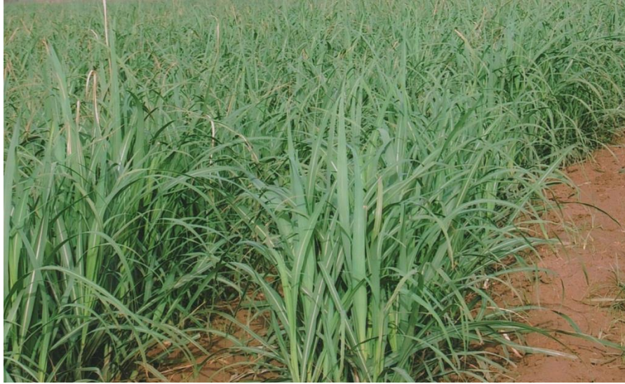
Early development of sugarcane in ring pits

The demonstration project was initiated during the year 2008-09 and continued in 2009-10. The assistance was reduced to Rs 4000 per acre during 2010-11, which continues to be the norm in 2011-12. A total assistance of Rs 48.72 lakhs has been utilised on this project during last 4 years covering an area of 812 ha demonstrating the technology in the fields of 359 farmers.