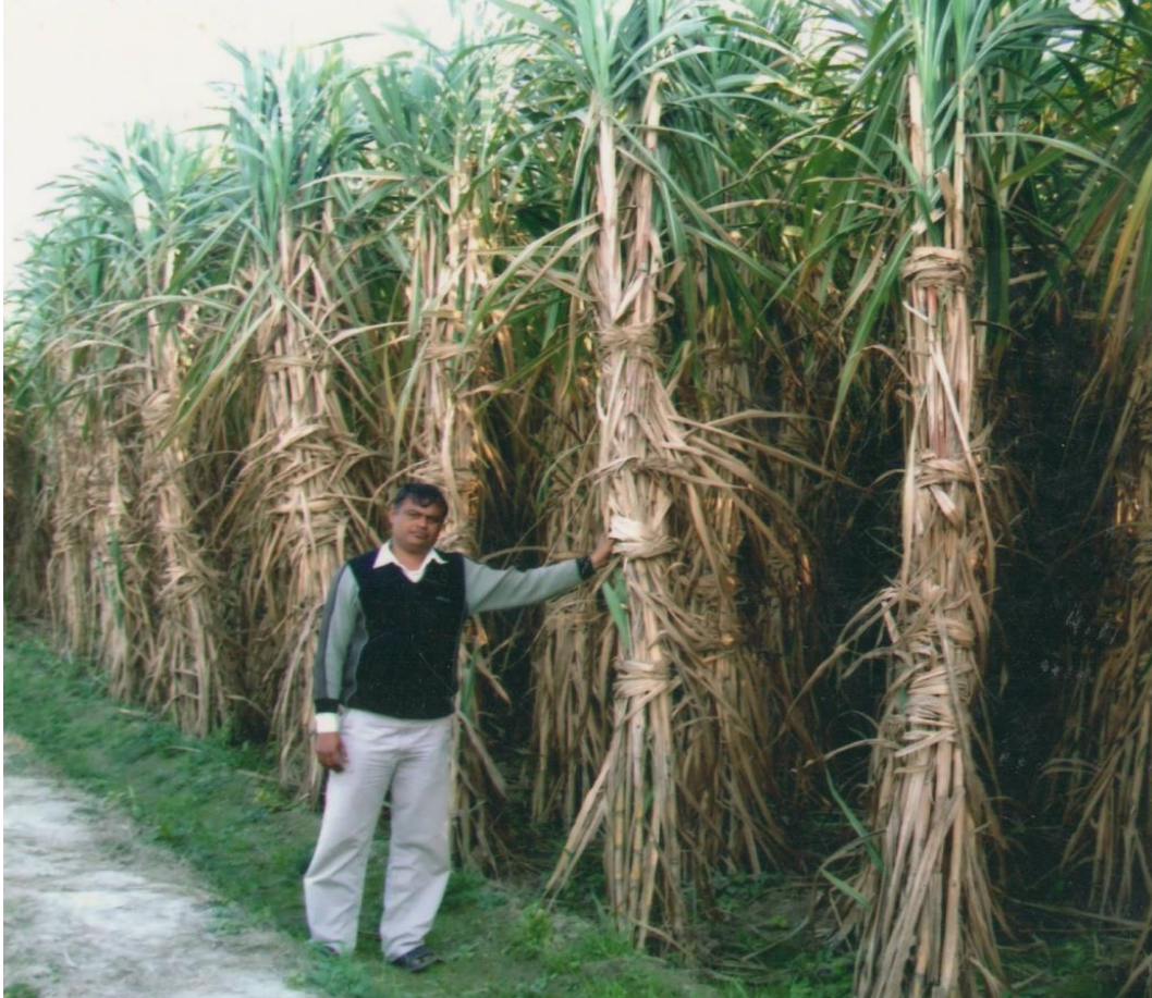
Sugarcane harvest in the fields using ring pit method of cultivation